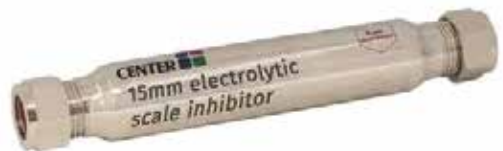
15mm 609937 - £19.97 22mm 609938 - £20.15