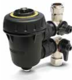
Mini 105287 - £95.56

Get up to 2 years extra warranty when you fit with a Worcester boiler