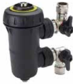
22mm 100303 - £104.57