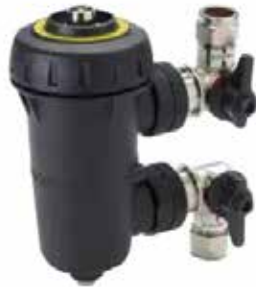
28mm 100304 - £185.58